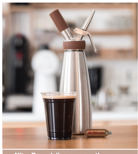
Nitro Brew delivers a smooth creamy taste without bitterness and with no added calories from cream and sugar!